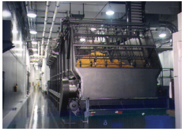
High capacity system installation