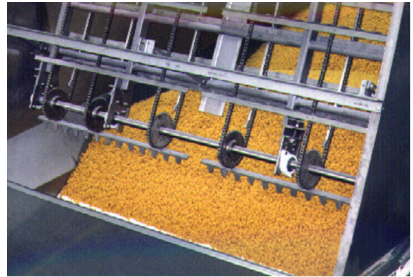
Discharge rake assembly