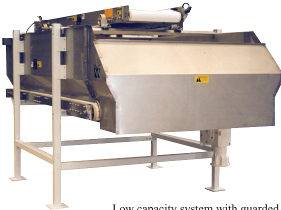
Low capacity system with guarded discharge and infeed shuttle belt

An equipment purchase from Meyer includes the complete backing of one of the most prestigious names in the material handling industry. Meyer equipment includes vibratory conveyors and feeders, bucket elevators, hopper/feeders, box loader/unloaders, spiral chutes and flow switching machines, used in a wide variety of industries to meet diverse applications. Meyer adds to the overall value of its equipment by providing responsive customer support at every level. Meyer support may include process consultation, equipment modification, new equipment design - or even a turnkey approach incorporating an integrated PLC - all designed to best meet the customer's unique requirements. Meyer further supports the equipment purchase with an extensive parts inventory and experienced, responsive service. Solid products, supported by outstanding service, that's what makes a Meyer, a Meyer.