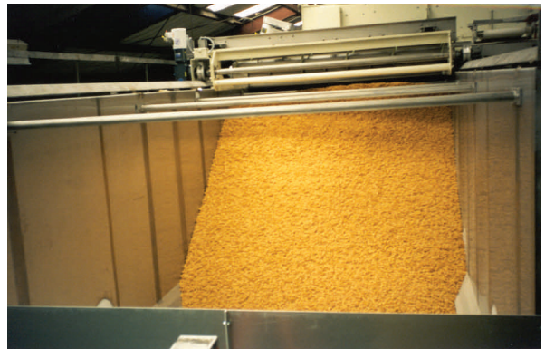
Even filling of storage unit allows for maximum efficiency