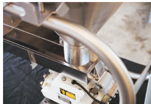
Adjustable Flow Control Sleeve

An easily removable hopper enables easy product changeovers, and an optional slide gate cut-off valve allows the hopper to be removed with product in it, without spilling.