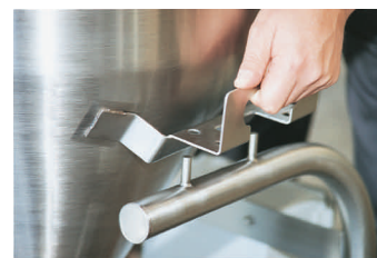
Easy Lift-Off Hopper

Accu-Flow™ Hopper/Feeders combine the precision of Meyer's proven EDF Series feeders with low level surge storage capacity. These units are ideally suited for product delivery to processing operations where surge capacity is required. For additional accuracy, Meyer also offers a precision Loss-In-Weight version.