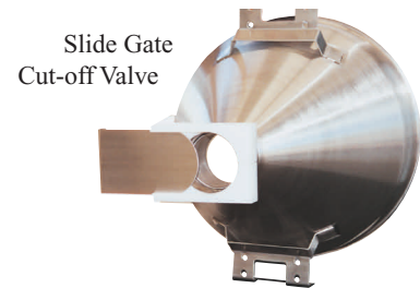
Slide Gate Cut-off Valve