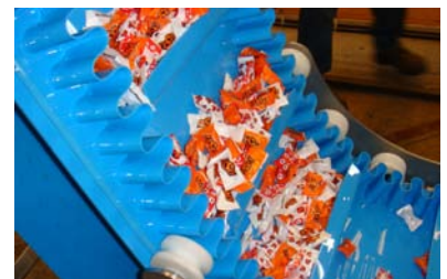
Can handle a wide variety of products