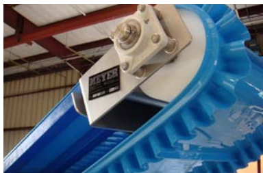
Polymer standoff bearings with stainless steel inserts