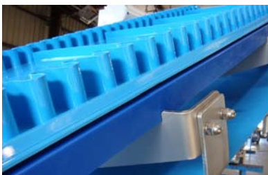
Removable belt support rails