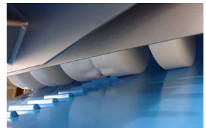
Positive belt drive