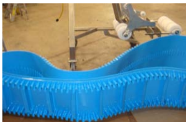
Available with one piece removable belting